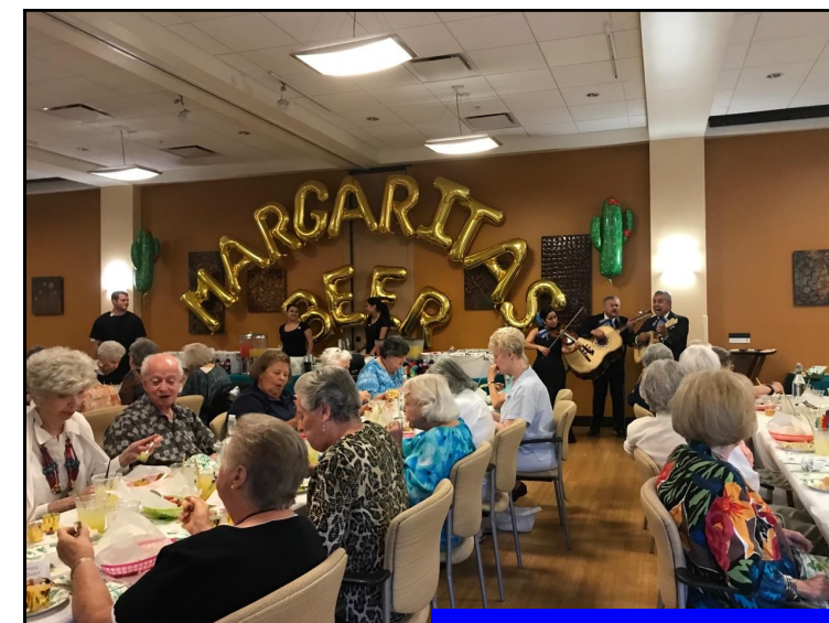
Taco Bout a Party!