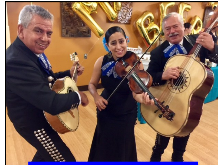
Happy Mariachi Trio!