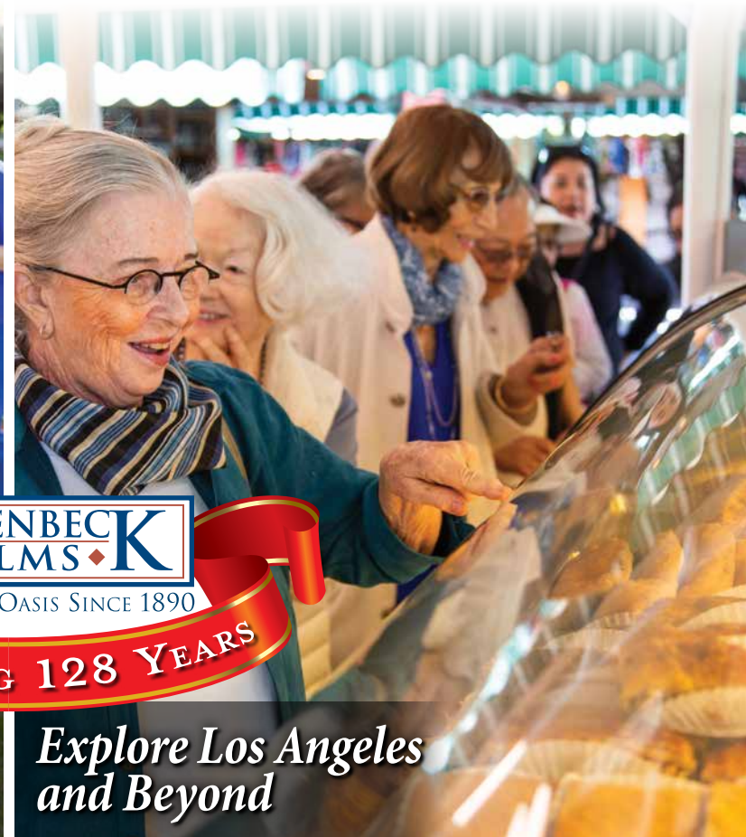
Explore Los Angeles and Beyond