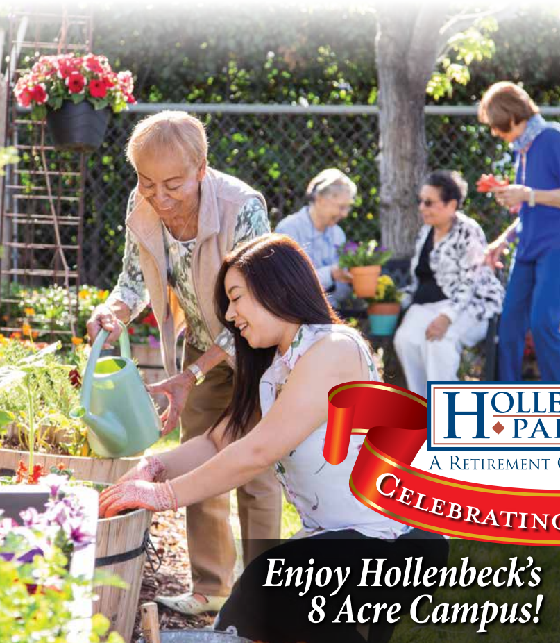
Enjoy Hollenbeck's 8 Acre Campus!

opportunity to learn things you've always wanted to learn. There are many opportunities on and off campus for that! Inside this newsletter, you'll learn about some of the many classes available for Hollenbeck residents – both on and off campus. Your residential needs and driving are in capable hands, so you can spend your time enjoying the activities you already love, and discover new ones. Hollenbeck living really is the best of both worlds – the relaxation of retirement and the excitement of new experiences!