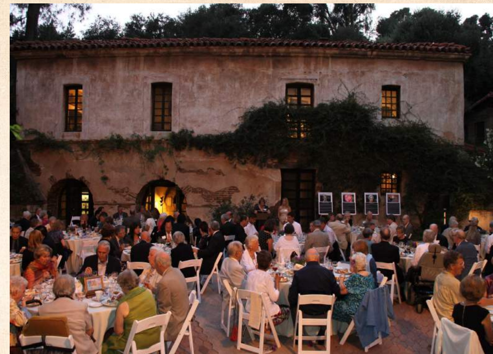
Friends of Monte Vista Grove Homes filled The Old Mill on a beautiful summer evening.