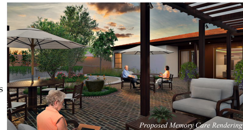
Proposed Memory Care Rendering

Monte Vista Grove Homes is blessed to have such outstanding volunteer support lending their efforts to the campaign. And, we are blessed by the supreme generosity of our donors. We know that “ with God all things are possible ” (Matt. 9:26) and so we press on toward our goal of new facilities to support all aspects of holistic aging.