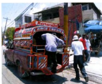
TYPICAL TRAVEL IN HAITI