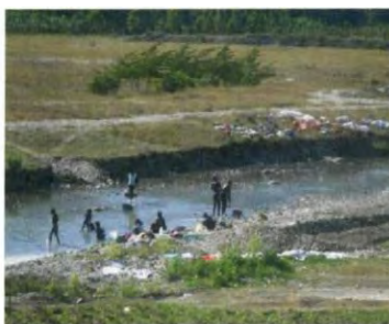
LAUNDRY DAY IN HAITI