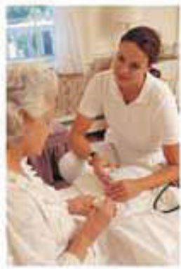
Home Health Care Staying healthy at home!