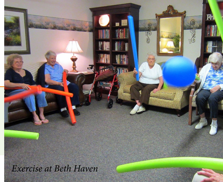
Exercise at Beth Haven

Aging .....the journey of life, which is different for each person