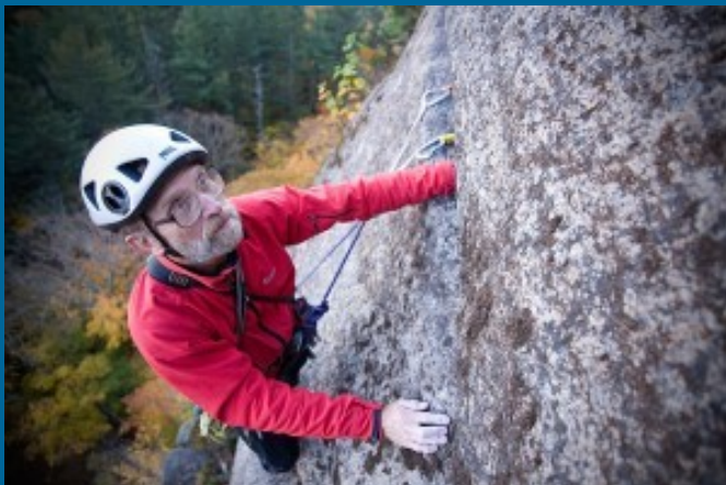
Photo of George by Anne Skidmore http://athletes.50interviews.com/a-very-big-week/