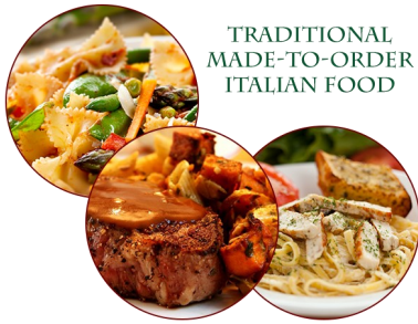
TRADITIONAL MADE-TO-ORDER ITALIAN FOOD

Wednesday – March 23 – Dining Out at Faro Italian Grille [Easy]. Enjoy fresh, delicious Italian cuisine at this impressive Italian Restaurant serving traditional, made-to-order Italian food. At Faro Italian Grille, you will find authentic Italian cuisine, a lovely atmosphere and a beautiful view of Lake Winnepesaukee. Faro's offers a wide selection of menu choices, some of which include traditional Italian Pizzas, Chicken Piccata, Braised Lamb and Pan-Roasted Salmon. The bus will begin picking up residents on the Laconia Campus at 4:30PM.