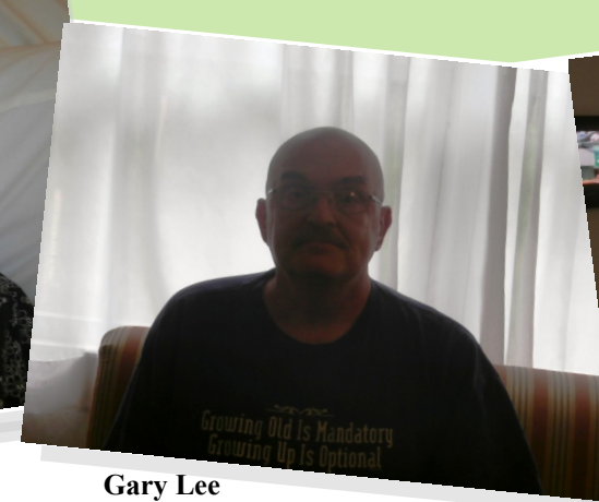
Gary Lee Apartments