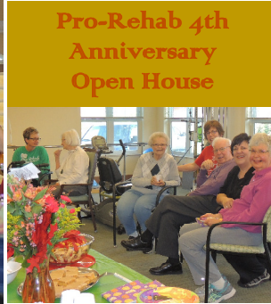
Pro-Rehab 4th Anniversary Open House