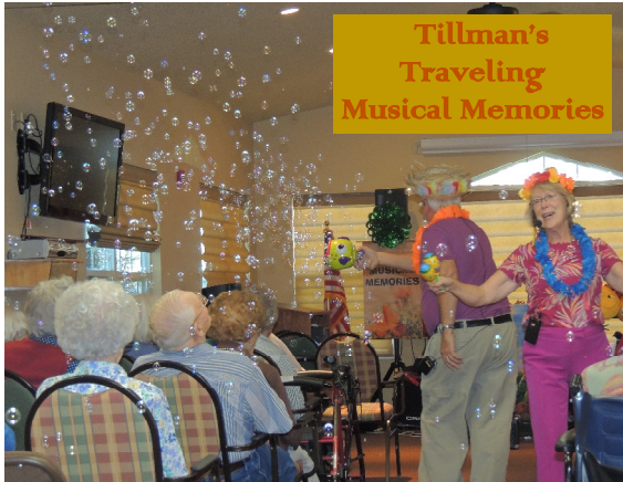
Tillman's Traveling Musical Memories