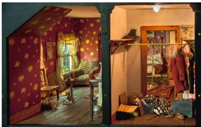
Red Bedroom , Frances Glessner Lee, mixed media

On Wednesday, November 29 , we will explore the new exhibit at the Renwick Gallery. Murder Is Her Hobby: Frances Glessner Lee and The Nutshell Studies of Unexplained Death . Frances Glessner Lee (1878-1962) crafted her extraordinary "Nutshell Studies of Unexplained Death"—exquisitely detailed miniature crime scenes—to train homicide investigators to “convict the guilty, clear the innocent, and find the truth in a nutshell.” Transportation costs $15.00 and admission is free. The bus will depart at 10:00 a.m. and return around 1:00 p.m.