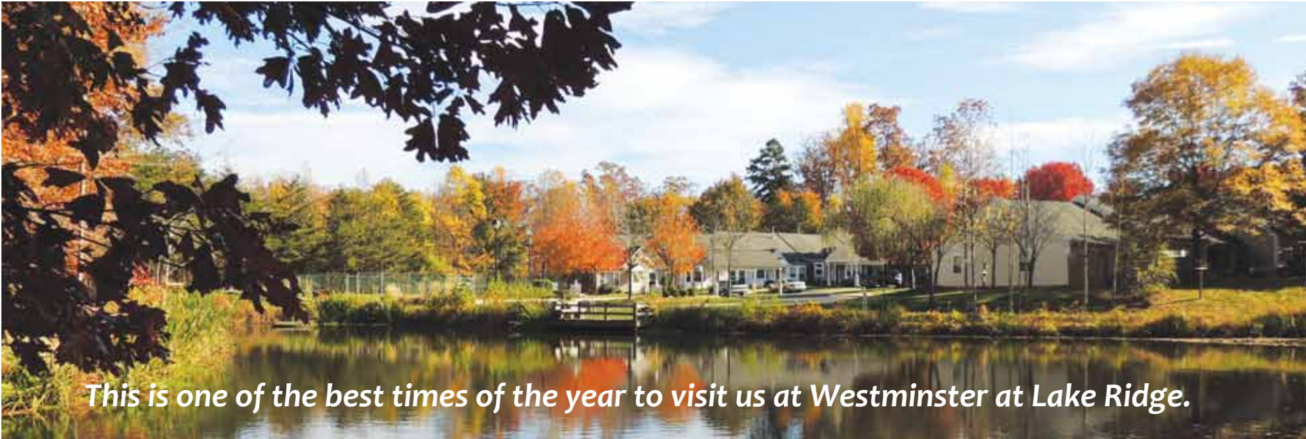
This is one of the best times of the year to visit us at Westminster at Lake Ridge.

We are very excited about our future planning project, Westminster OnWard (WOW). We held our first work session August 28th, facilitated by the architectural firm Perkins Eastman. During this session, we approved conceptual plans for several projects that will begin in 2018. These projects create “destinations” that will support the community’s operations and provide additional spaces for the well-being and enjoyment of our residents. The projects include a new bistro with outdoor seating, as well as expanded fitness facilities, a multi-purpose studio and classroom that will be part of a Center for Healthy Living.