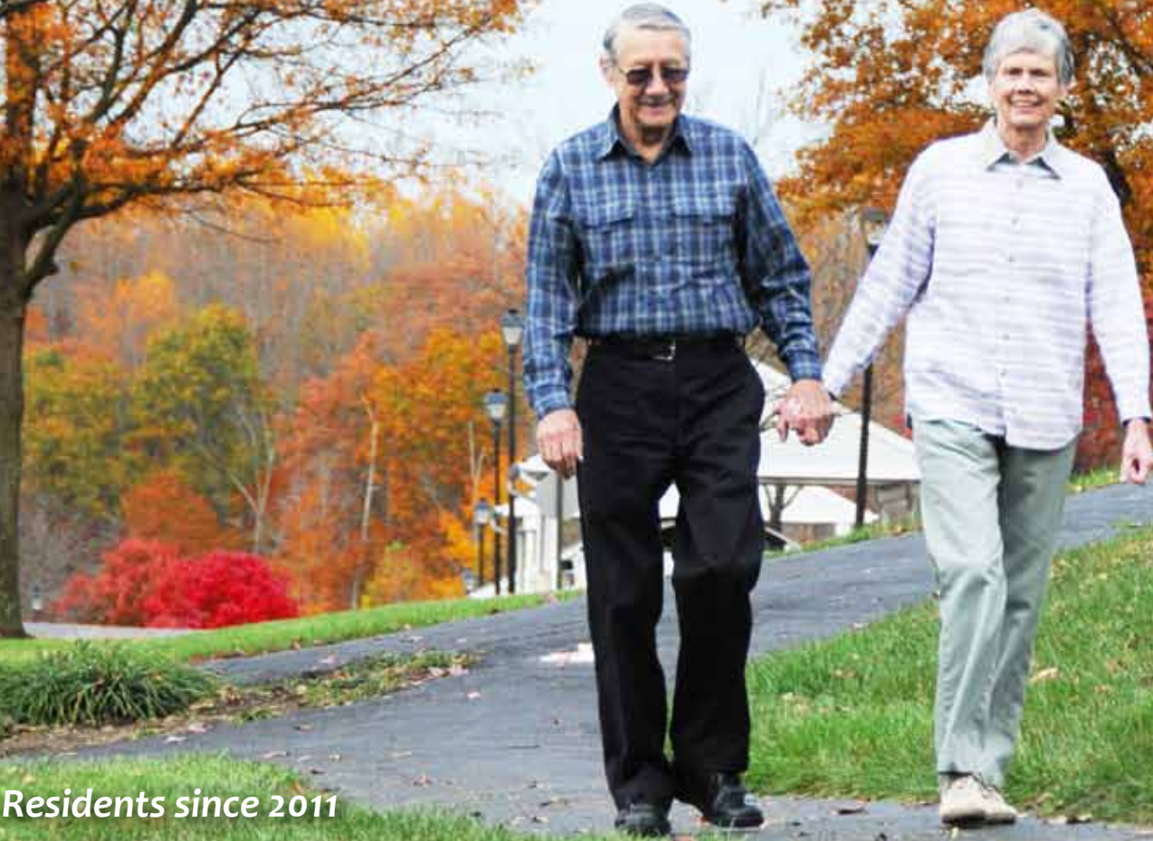
Residents since 2011

IN THIS ISSUE INGLESIDE AT HOME Home Care Service THE WOW FACTOR Introducing Westminster OnWard