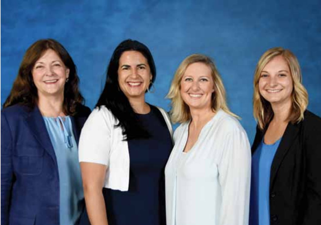
The Marketing Team at Westminster at Lake Ridge

There couldn't be a better time to visit Westminster at Lake Ridge. Occupancy in both apartments and cottages at Westminster at Lake Ridge has remained strong—but that also means that selections can be limited, with a waitlist for popular locations and floorplans. If you are considering a move to the community, now is the very best time to visit and see what we have to offer! The best way to learn about our community is to learn for yourself. You can talk with residents, people just like you, who are enjoying the life they deserve in a place they love. We would like to personally invite you to visit us. It will inform and inspire you to see your future in a new light—a future at Westminster at Lake Ridge.