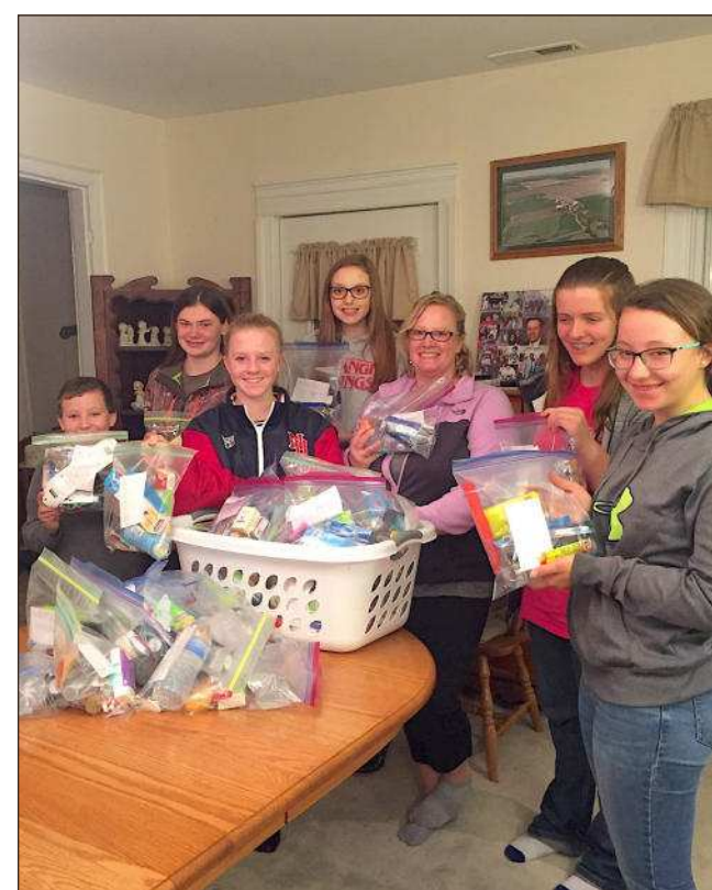
Members of the Dorchester Trailblazers 4-H Club assembled "blessing bags" at a recent meeting for their service project

To learn more about 4-H or the Trailblazers 4-H Club, visit dchs.extension.umd.edu/dorchester-county