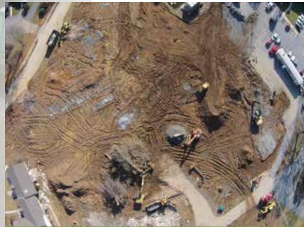
The site for the Learning & Wellness Center has been cleared. Next steps include installing storm water controls to manage runoff. Gas service to Harvest View will be relocated at a later date.

For more information and updates, visit landishomes.org and follow the link to the Connections Campaign website. You can also watch a live webcam on YouTube, Building the Learning & Wellness Center at Landis Homes. Http://Bit.ly/LearningandWellnessCam