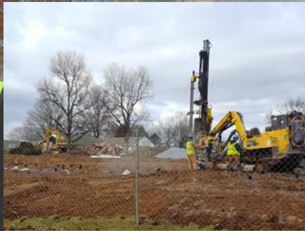
Digging out for the parking garage and building foundations is underway. A considerable amount of rock is located in this part of campus, so drilling and blasting has been required.