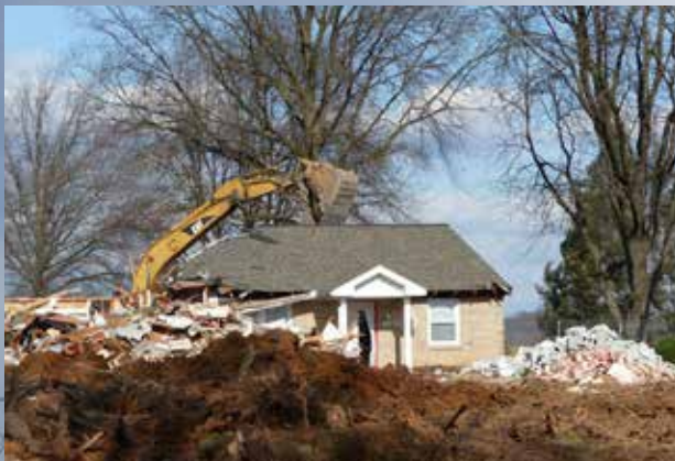
A mild start to the winter has enabled significant progress to be made! Phase 1 demolition is complete. Nine buildings containing 30 homes have been removed to make way for the Learning & Wellness Center.