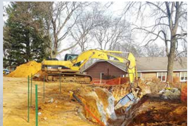
Underground electric within the building footprint needed to be relocated. New electric lines were installed, and on January 19 Landis Homes experienced a planned campus-wide power outage to abandon the old and energize the new service.