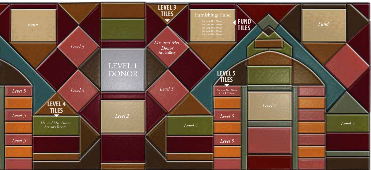
Donor Recognition Panel