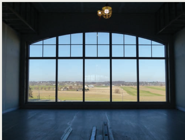
View from the Community Room