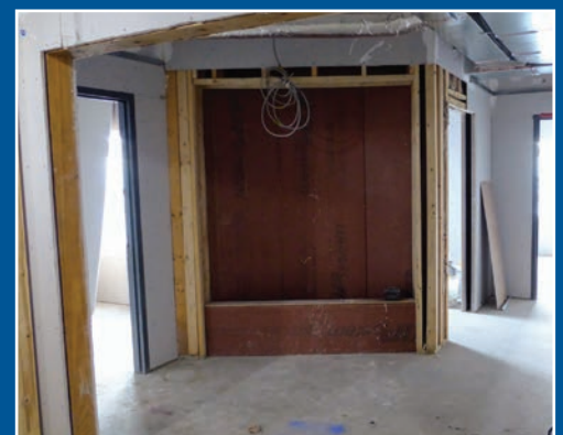
The Quiet Place in Progress

Designed as a place for personal meditation and prayer, The Quiet Place will focus on the spiritual dimensions of wellness. It will include a water feature and three small rooms for one to four people to gather. Comfortable seating, windows with natural light and the soothing sounds of the water will make this a destination for residents, family and team members.