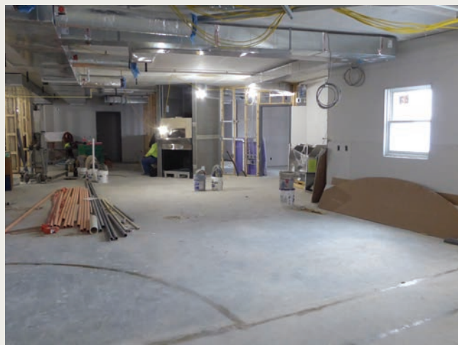
Owl Hill Bistro

Everyone has been able to share in the excitement with monthly Walk-Through Video Tours shown on campus television, posted on YouTube and shared on Facebook. Take a look to see the pool, bistro, bank and more! The January video includes two of the Crossings apartments. Construction of phase 2A Crossings Apartments began in September 2017. All 33 units have been reserved. Phase 2B reservations will begin soon!