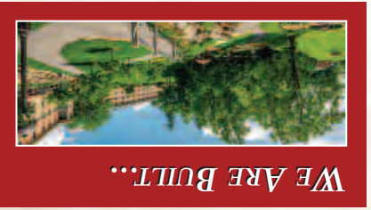
WE ARE BUILT...

Morningstar Senior Living Inc. announced a new member of the corporate family following the acquisition of Senior Solutions in December 2012. As one of the Lehigh Valley’s oldest home care and geriatric care management businesses Senior Solutions has been serving seniors for 22 years.