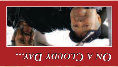
ON A CLOUDY DAY...

NON-PROFIT ORG. U.S. POSTAGE PAID LEHIGH VALLEY, PA 18002 PERMIT NO. 601