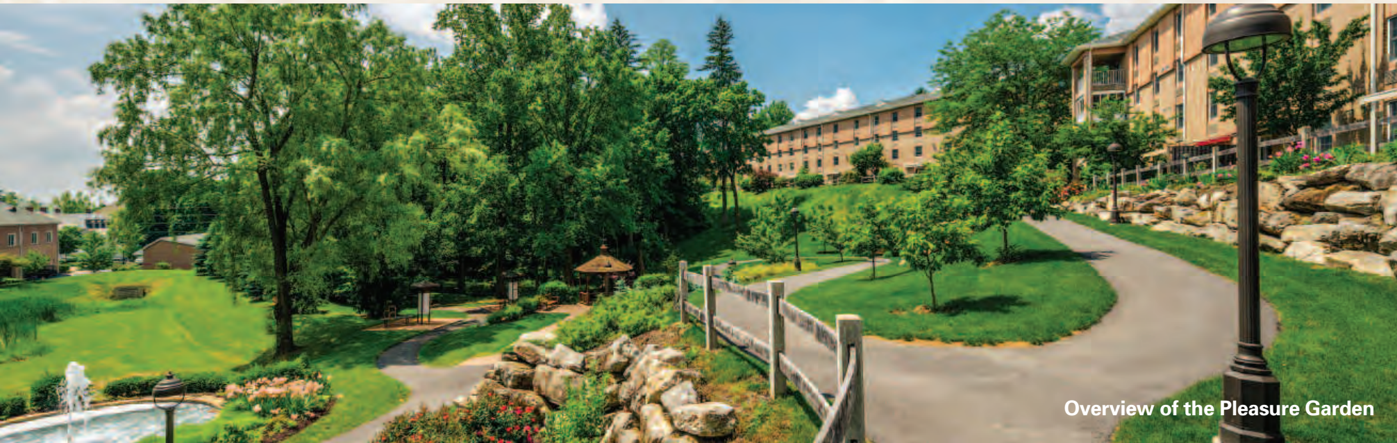
Overview of the Pleasure Garden

The original campus setting has definitely evolved over the years – expansions of space and human resources, innovations and improvements, enhancements and awards. This tract was and still is hallowed ground. It is a place graced by the vision of founders, blessed by those who have lived and labored here and revered for the ministry to providing refuge in a spirit of community for more than 200 years.