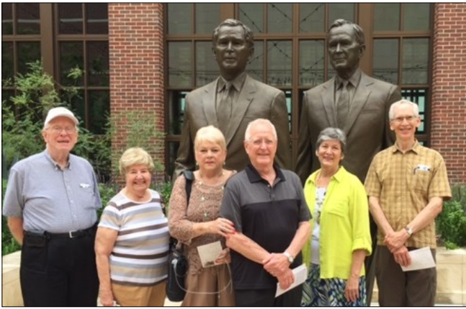
At the George W. Bush Presidential Library