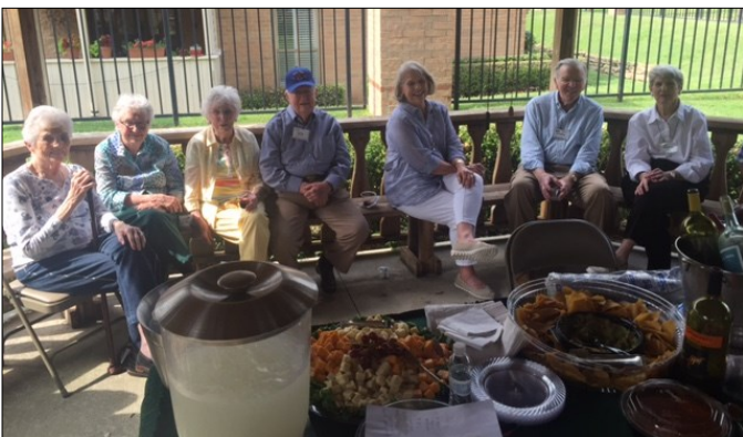
North 10 Spring Fling