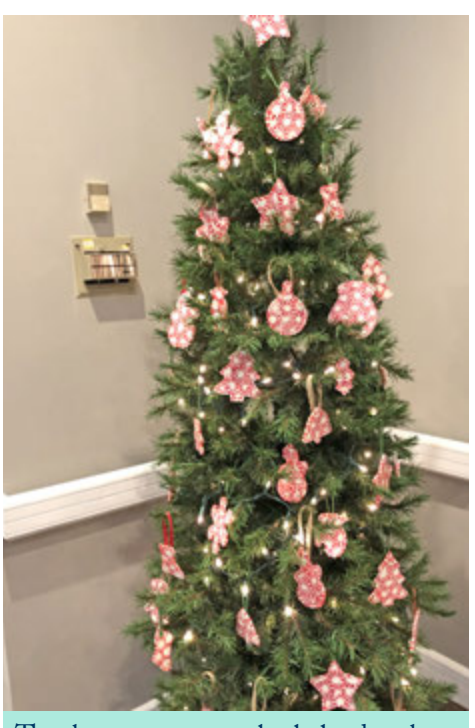
Thanks to everyone who helped make the peppermint ornaments for our tree.