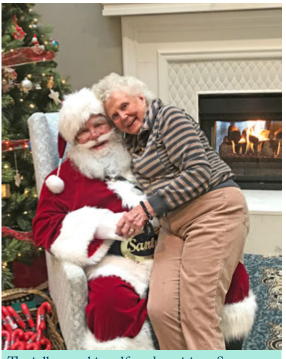
The jolly man himself made a visit to Seasons and heard lots of Christmas wishes.