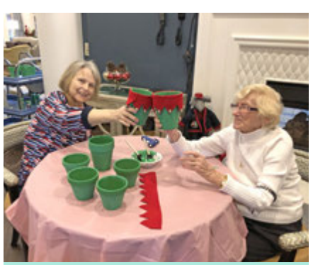
Our very own elves making elf candy dishes worthy of the North Pole toy shop.