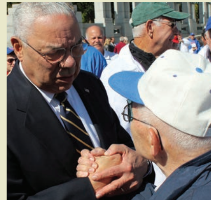
A grateful Colin Powell greets Bud.