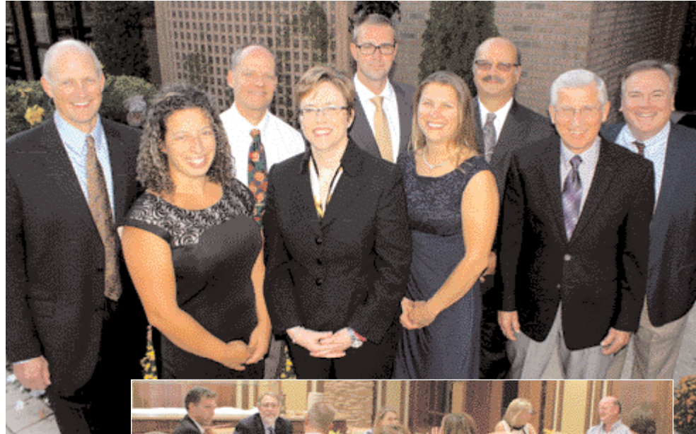
Rockhill's Board of Directors hosted the dinner.