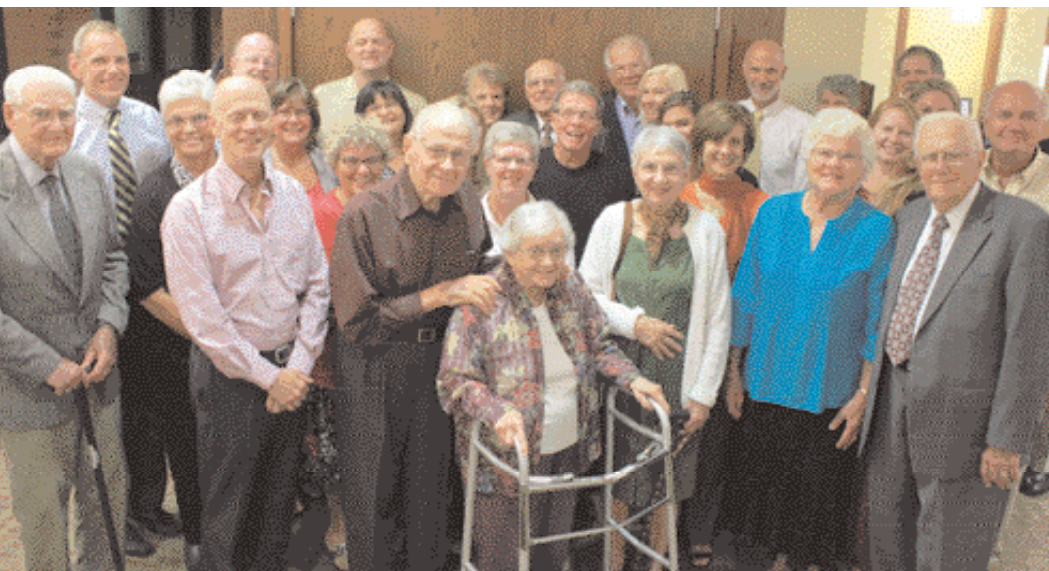
The extended Alderfer family travelled from near and far to celebrate the event.