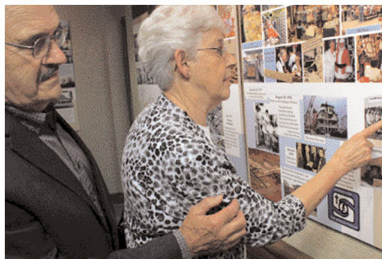
Exploring Rockhill's history.