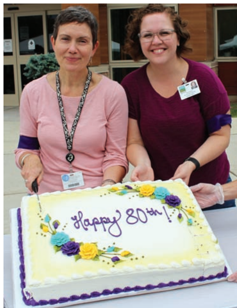
Happy 80th birthday Rockhill!