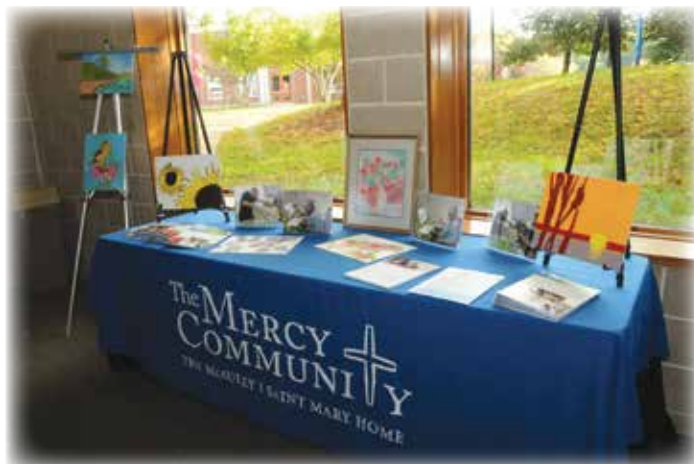
The Mercy Community proudly displayed some of its residents' works at The University of Hartford so that guests could see firsthand the results of art therapy programs.