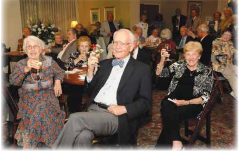
A toast to 25