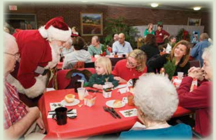
(Above and right) Santa double checks the finer points of holiday wish lists for believers of all ages.