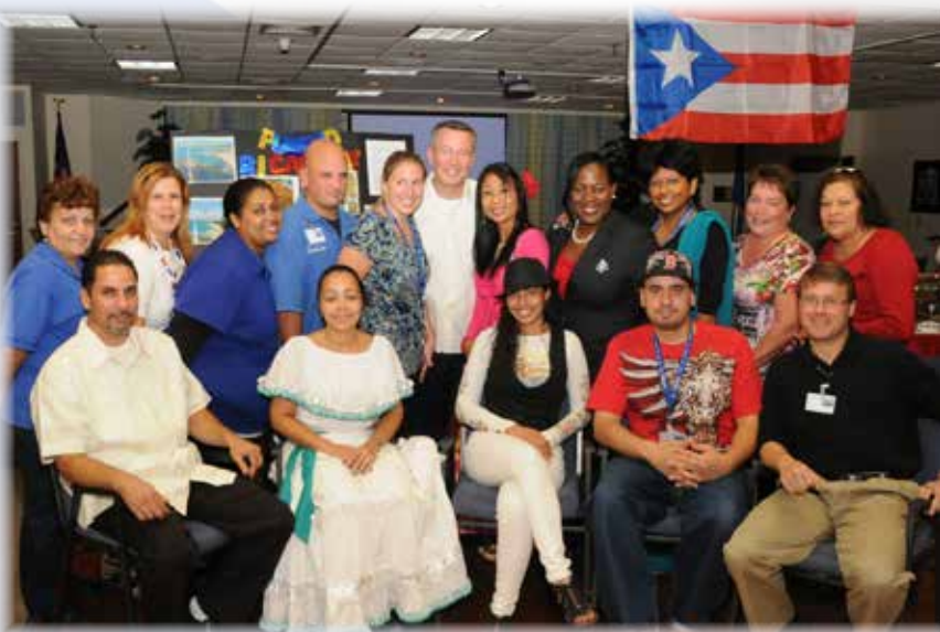
The Cultural Day of Celebration Committee relaxes after Puerto Rico Day at The McAuley