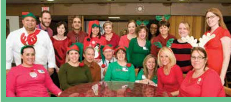
The Elves of Saint Mary Home