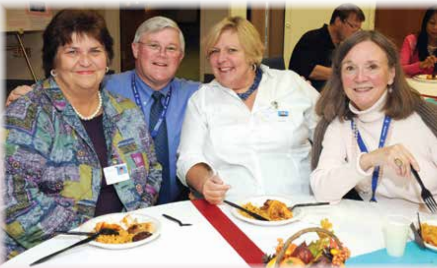
Colleagues from The McAuley enjoy Puerto Rican delicacies.