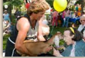
Some very special guests came to celebrate Grandparents Day.