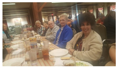
Das Essenhause Outing