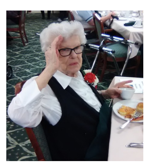
We Salute All The Veterans and say Thank You For Your Service!