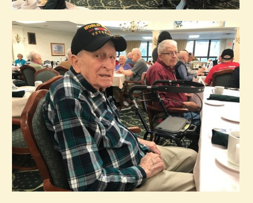
Veterans Breakfast We honored our St. Paul's veterans with a special breakfast & program with over 75 in attendance!