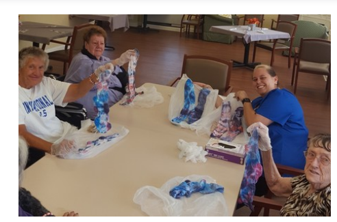
Tie-dyed socks craft