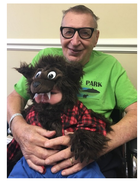
There was a scary/cute wolf captured!