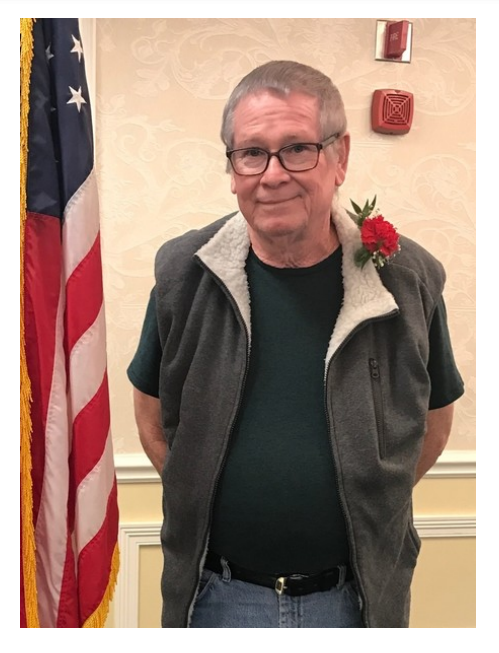
We had men and women representing all branches of the military.

St Paul's Store Staff Here are some of the wonderful volunteers who help run our little store here at St. Paul's. You can find the store across from the Main Chapel. It is open Mon, Tue, Thurs, Fri, Sat, 10-12. You can find food, gifts, toiletries, snacks and so much more. Stop by and see all the items we carry!