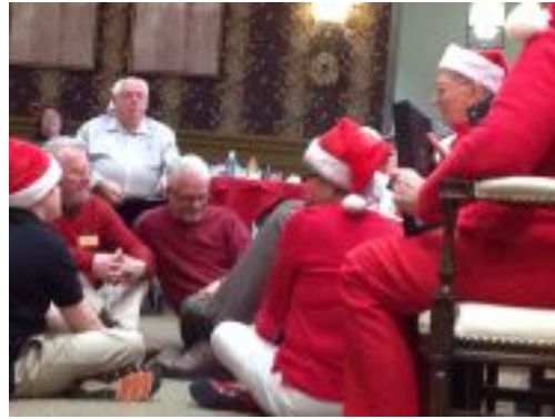
A few of the cast doubled as "children" during the reading of The Night Before Christmas by Paul Bryant.