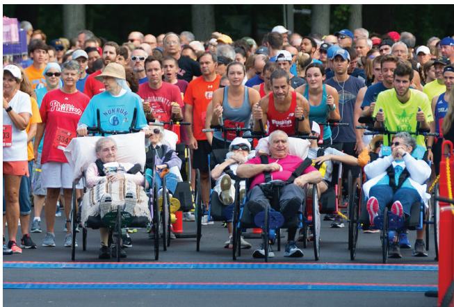
Runners at the starting line waiting anxiously for the race to start.