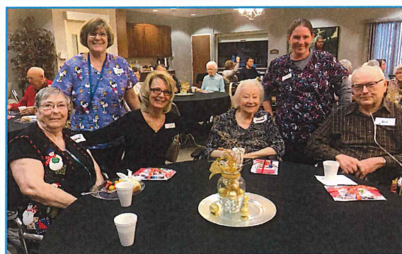
Hammond Center Holiday Coffee

amenities will be located. Many attendees socialized in the Hawn Center before and after their tours while eating Christmas cookies and sipping on hot cider!