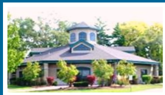
Semerad Pavilion (Clubhouse) 1327 Crystal Avenue | Naperville, IL 60563