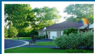
Independent Living Community (A Patio Home) Naperville, IL 60563