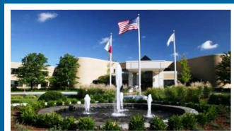
Healthcare Facility 1347 Crystal Avenue | Naperville, IL 60563