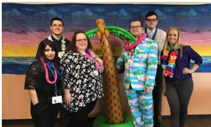
Nursing Home Week Decorating Committee