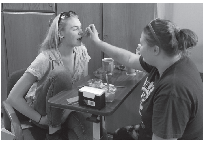
Learning to assist in eating