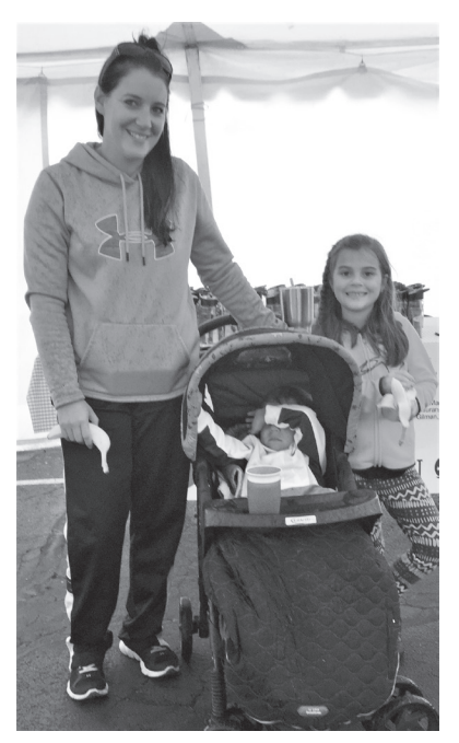
Strollers and children joined in!