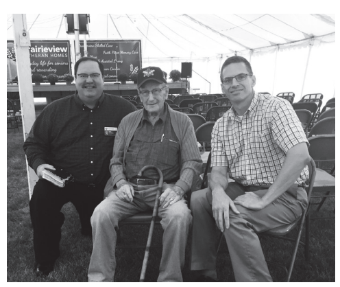
Ready for the festivities to begin!