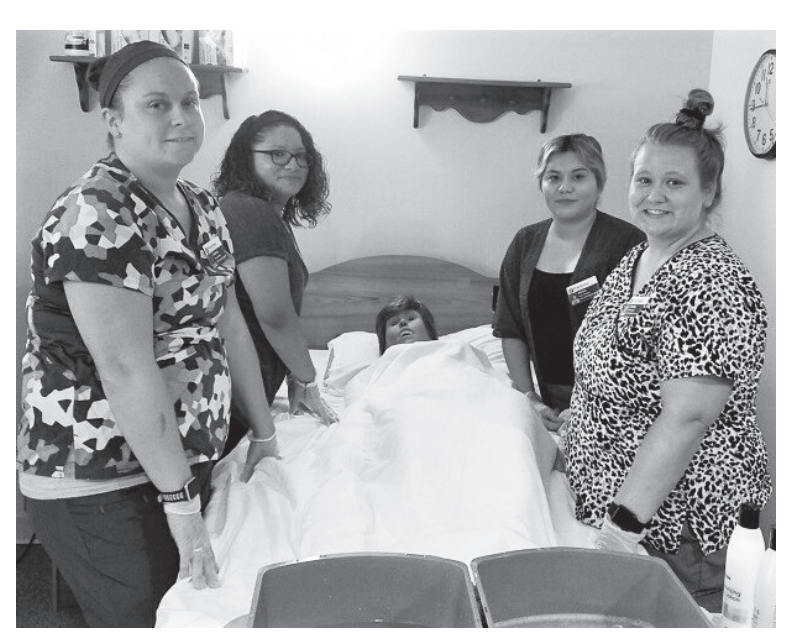
Working with Simon, the CNA class dummy