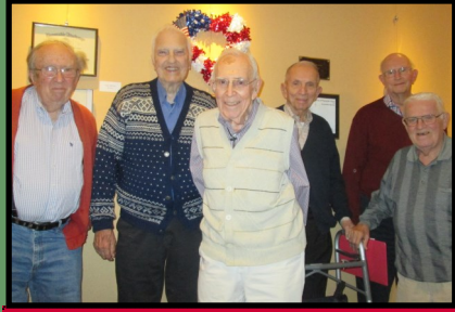
Veteran's Gallery Exhibit