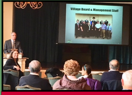
State of Village Address