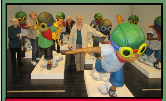
Elmhurst Art Museum Trip