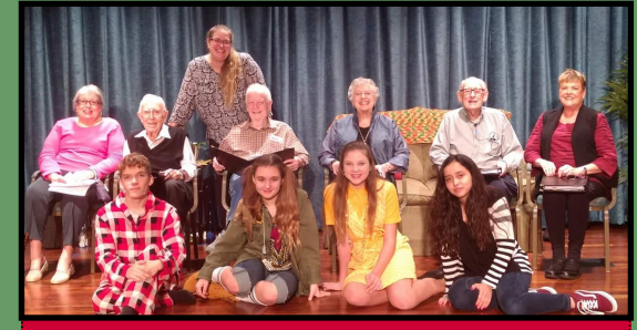
LATTE & Players Show