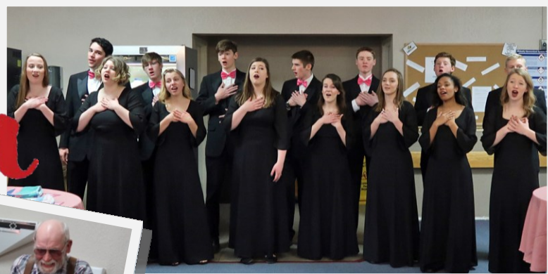
Above: Smoky Valley Madrigals serenaded residents and staff during lunch on Valentine's Day.