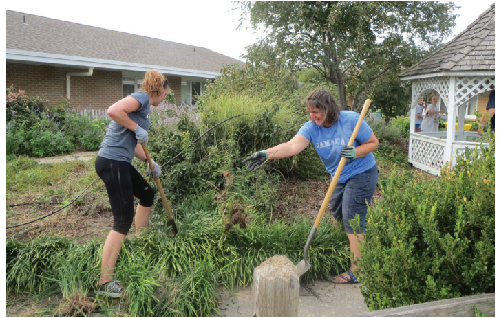
The Butterfly Garden gets a face-lift