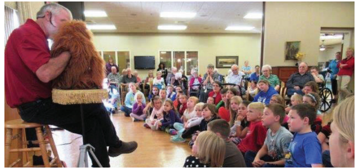
Residents enjoy a Halloween ventriloquist show with elementary students.