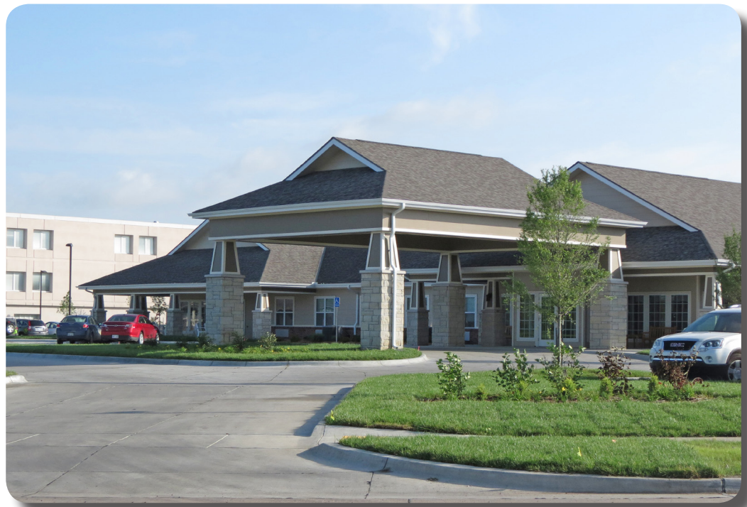
Exterior of our new Assisted Living building.