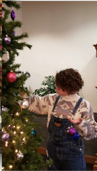
We were blessed to have help decorating from the FFA kids at BHS. >