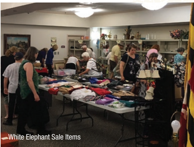
White Elephant Sale Items