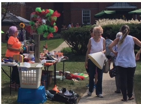
Outside Flea Market Vendors