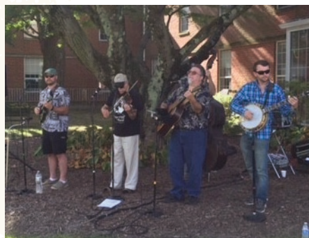
Satyr Hill Band