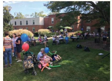
Residents and Families Enjoying the Band