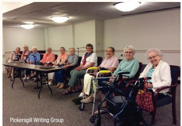
Pickersgill Writing Group