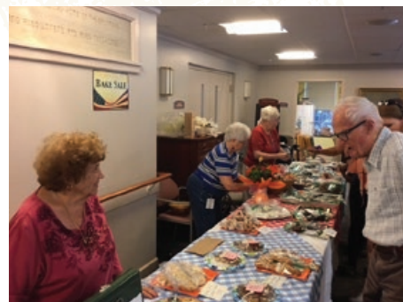
Bake Sale Table