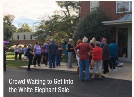
Crowd Waiting to Get Into the White Elephant Sale