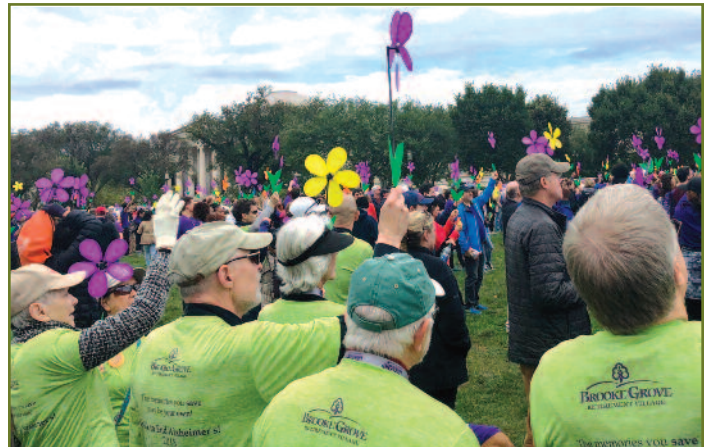
Team members raise colorful promise flowers in honor of loved ones and in support of the vision for a world without Alzheimer's.

Alzheimer's disease through the advancement of research, to provide and enhance care and support