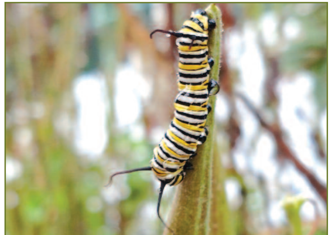
A monarch caterpillar before beginning its remarkable metamorphosis into a butterfly

allows researchers to learn about the origins of monarchs that reach Mexico, the timing and pace of the migration, and much more.