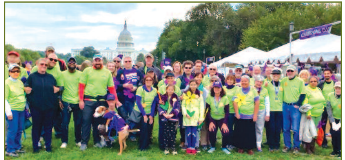
BGRV's 2018 Walk to End Alzheimer's® team

The Alzheimer's Association is the leading voluntary health organization in Alzheimer's care, support and research. Its mission is to eliminate