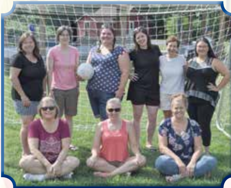
G.A. staff poses at Foster Family Picnic.

G.A. Family Services recently completed a strategic planning process, and the committee is focusing on