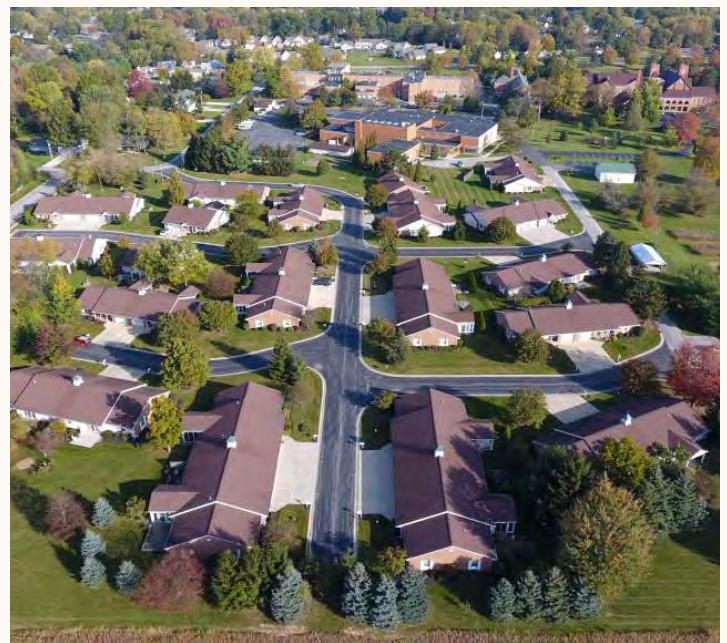
St. Francis Senior Ministries today, extending from bottom to top of photo.