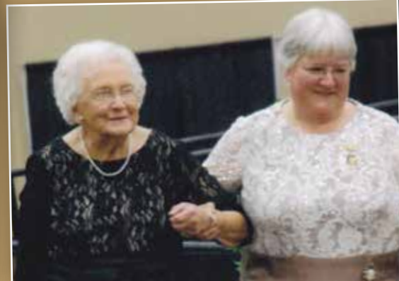
A Shot in the Park Photography