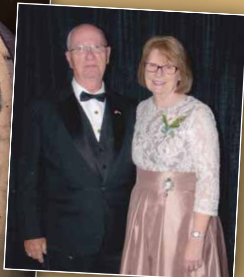
A Shot in the Park Photography