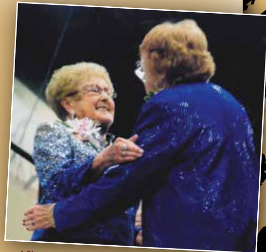
A Shot in the Park Photography