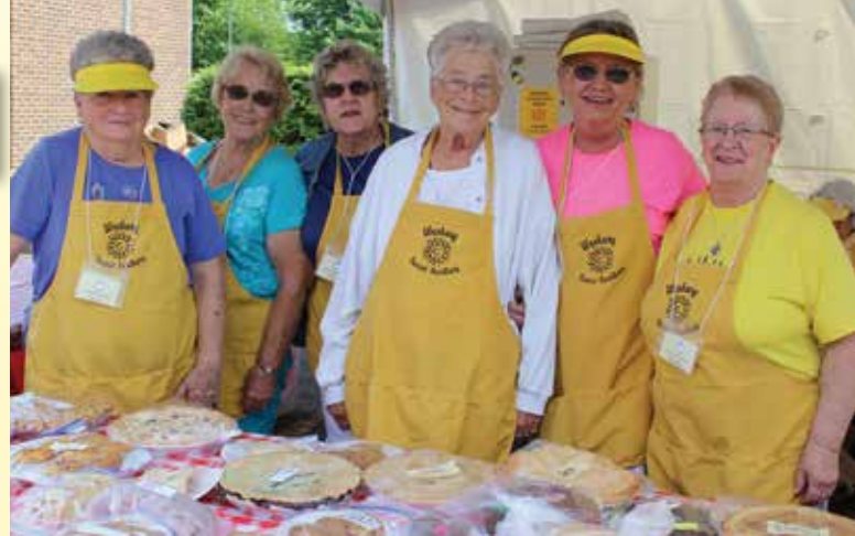
Members of Wesbury's Sunset Auxiliary at the 2017 Chicken BBQ Bake Sale.

The Sunset Auxiliary would like to thank everyone who donates items to sell or purchases items from their