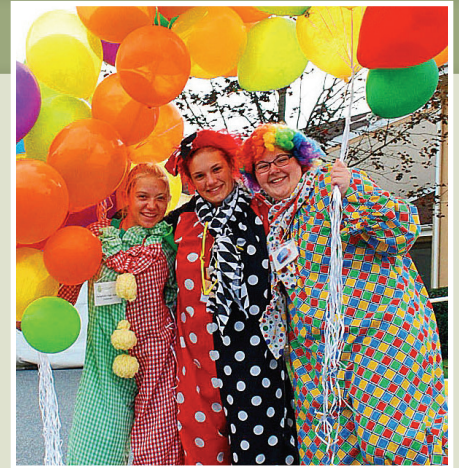
Don't miss our Homestead Day Festival!