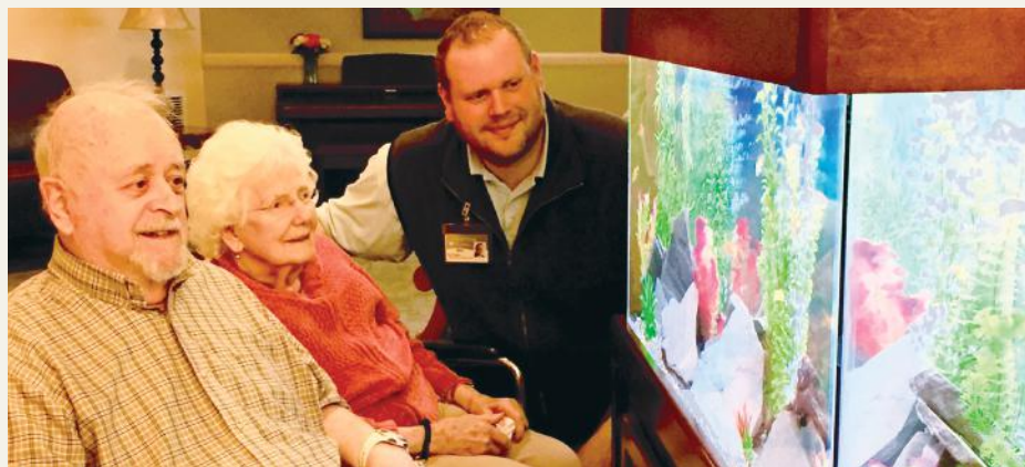
Residents and staff admire the colorful fish in the new Apostles Center aquarium.