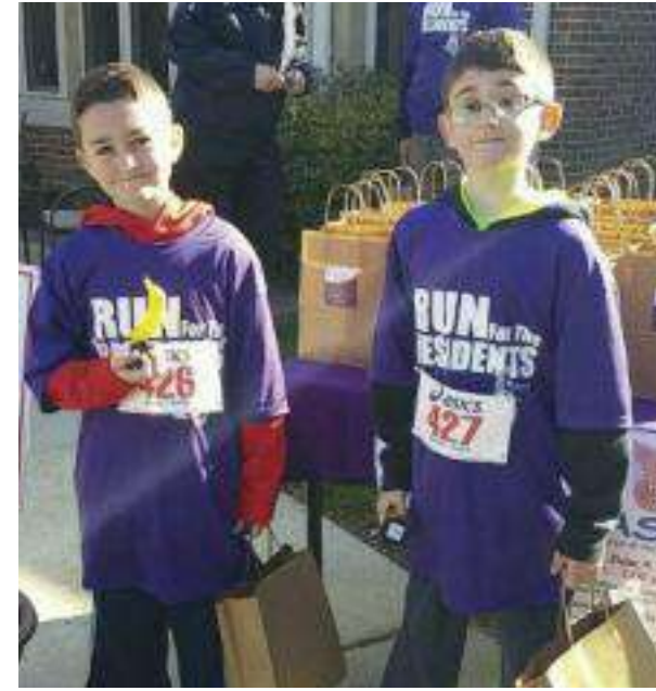
RUN FOR RESIDENTS April 1, 2017