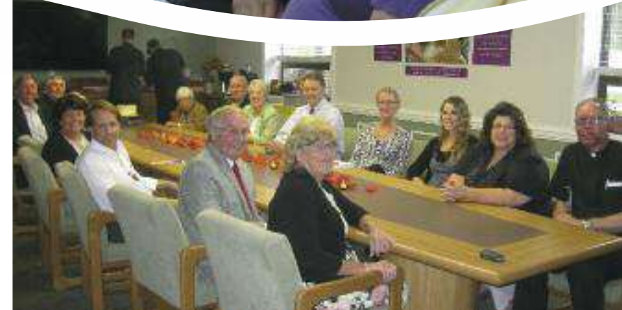
Blessing of the Ann B. Barshinger Personal Care Memory Support Center

Only Two Issues of Heart TO Heart will be printed per year.