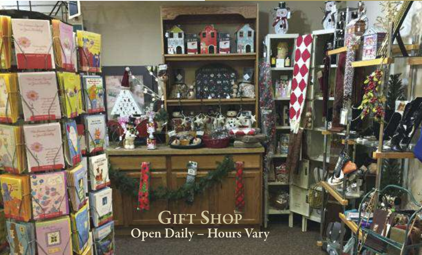
GIFT SHOP Open Daily - Hours Vary