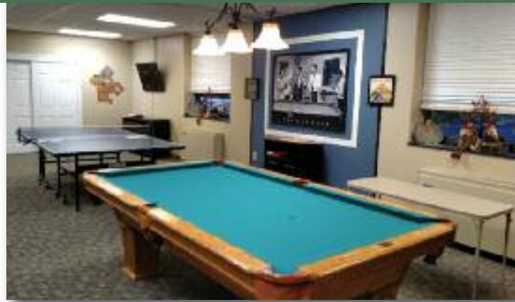
Residents enjoy shooting pool, knocking down pins while bowling with the Wii, or racking up points during a fun game of pinochle or gin rummy with friends.