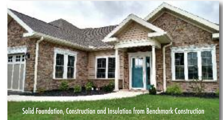
Solid Foundation, Construction and Insulation from Benchmark Construction