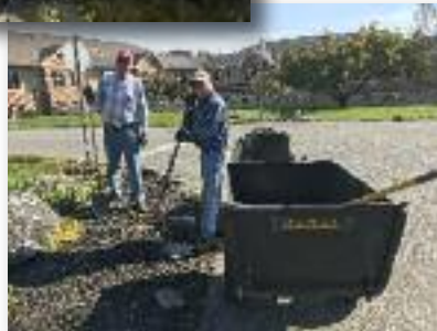
Maintenance-free living delivered by a friendly team