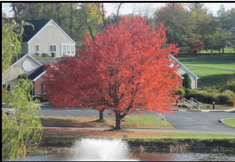
Spectacular fall foliage adorns the Nottingham Village campus.