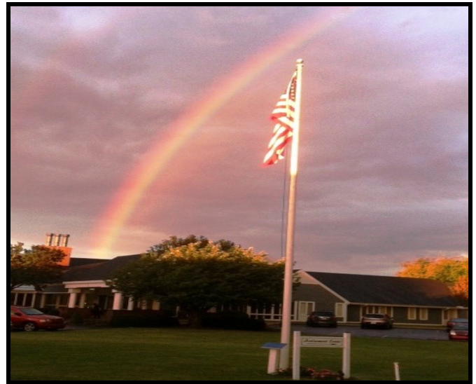
Rainbow over the Retirement Center

In 1977 we opened the doors to the Nursing Center at Nottingham Village. For all of 2017 we have been celebrating our 40th Anniversary with fun events for residents and staff. On August 26th we held a fireworks extravaganza!