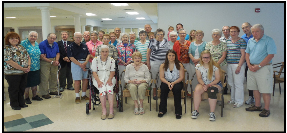
Nottingham Village honors our volunteers at a sumptuous brunch.

Our newest retirement Country House design on Hampton Way has been very popular. We offer an oversized two car garage as well as granite countertops, stainless appliances, custom closets, full attic and an architecturally designed floor plan.