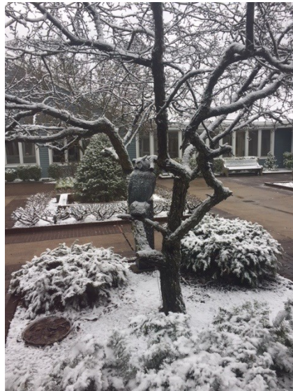
View of the last winter snow- fall looking out at the owl on the Retirement Center patio.