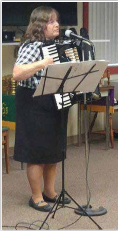
Everyone loves a good accordion player.