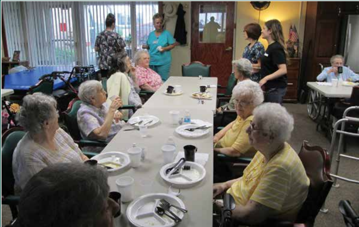
Our ladies enjoying a Women's Breakfast together.

NON-PROFIT ORG. U.S. POSTAGE PAID CHAMBERSBURG, PA PERMIT NO. 171