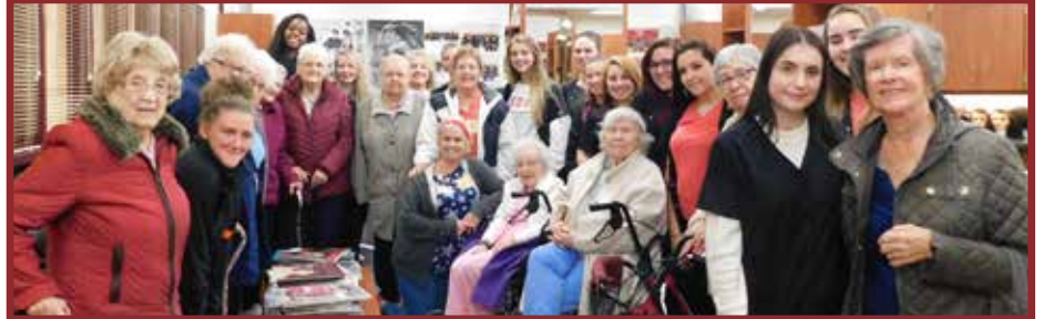
Ladies from The Ridgewood and The Heritage spent the day on Friday, Nov. 9 at the Mercer County Career Center. Lunch was provided free of charge by the Culinary Department and pedicures and manicures were done by cosmetology students! Everyone had a great day!