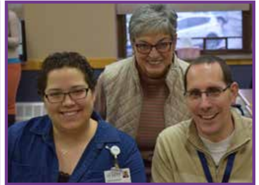
Colony residents hosted employees from the IT and Accounting Departments on Nov. 20 for the annual IT & Accounting Appreciation potluck luncheon. Lots of yummy dishes were shared along with many thanks to our dedicated staff members!