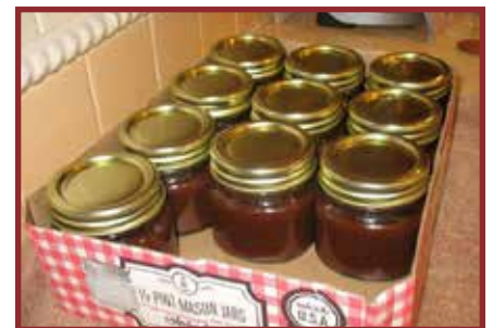
The finished product!