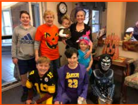
Staff, residents and family members enjoyed trick-or-treat all across campus on Friday, Oct. 26. Then some enjoyed hayrides and a party in the Headland Friendship Commons.