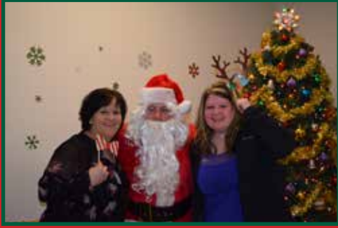
Employee Christmas Party