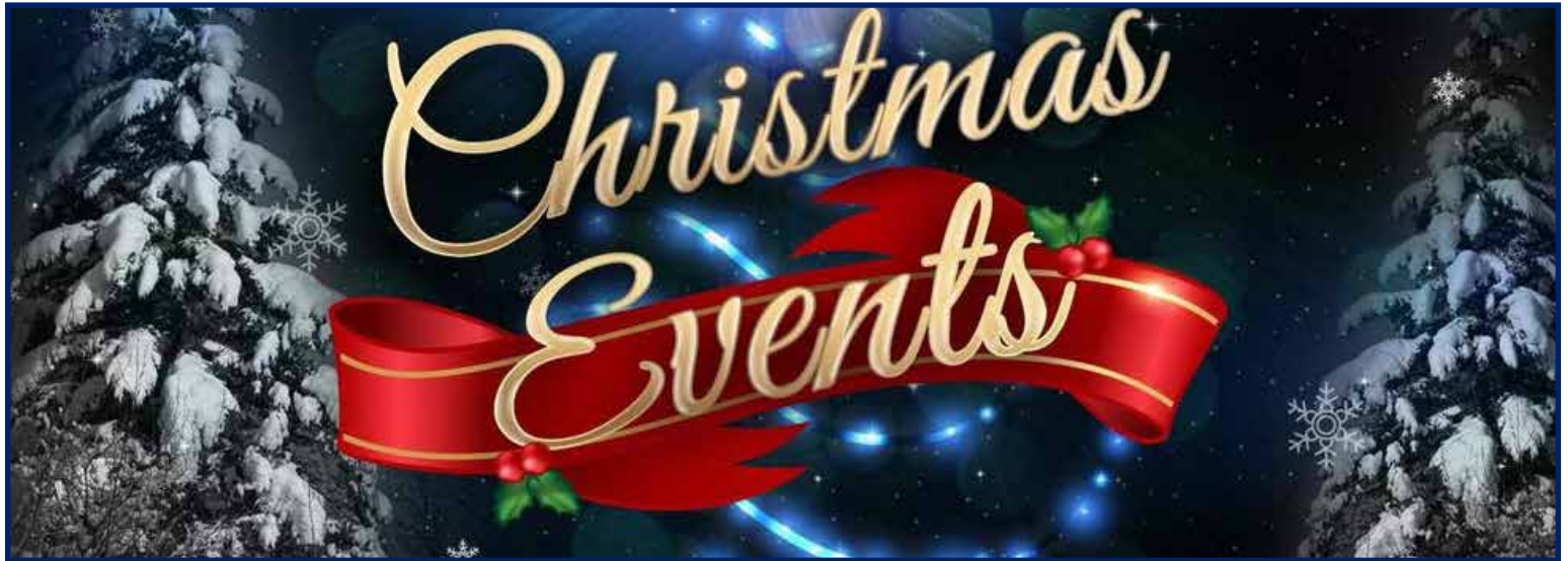
Christmas Dinner at The Colony