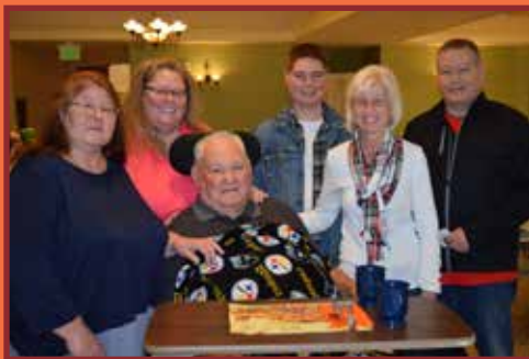
Thanksgiving Dinner at The Villas

https://www.stpauls1867.org/about/photo-gallery