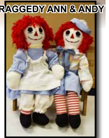
RAGGEDY ANN & ANDY

Ceramic 15" golden retriever figurine. Perfect for your porch or entryway.