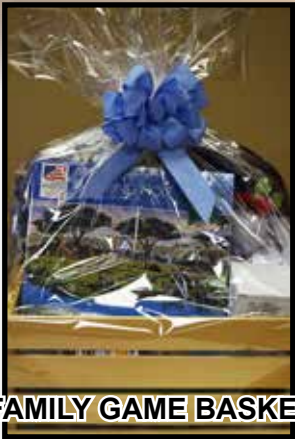
FAMILY GAME BASKET

Take a look at the many beautiful auction items that will be available at the Craft Show and Bake Sale on Nov. 2! Auction tickets will be for sale during the event and the winners will be chosen at 4 p.m. in the Headland Friendship Commons.